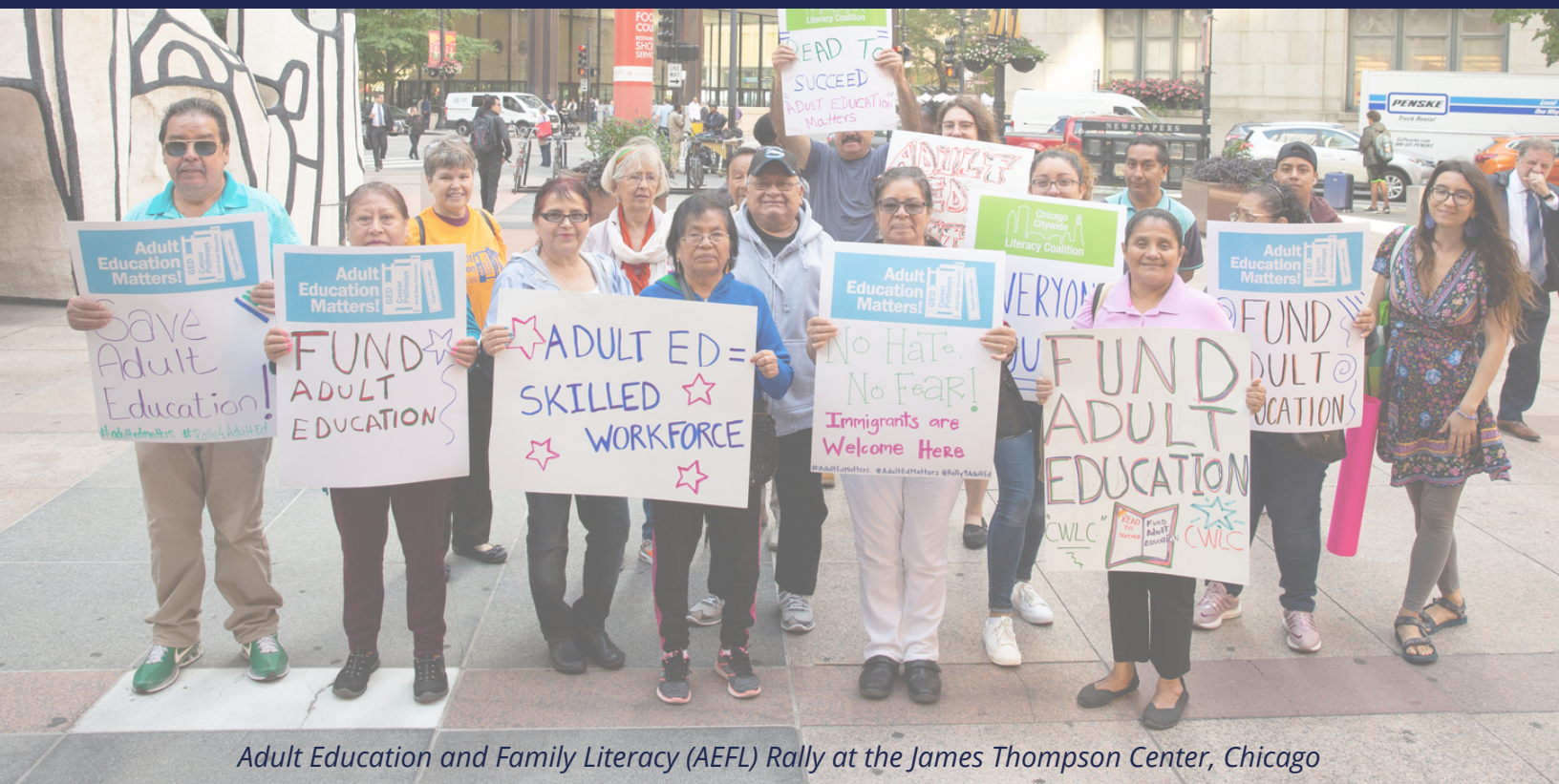
Adult Education and Family Literacy (AEFL) Rally at the James Thompson Center, Chicago